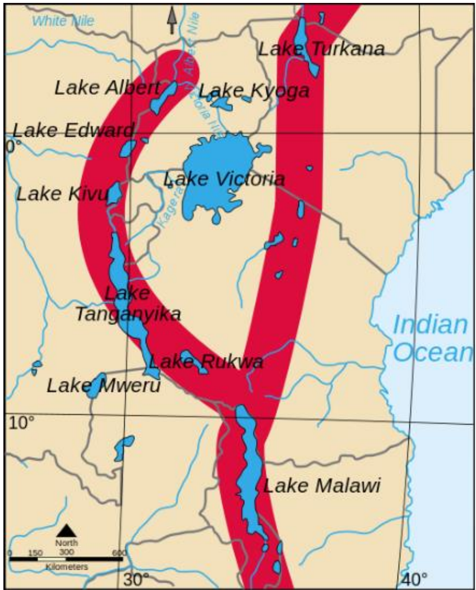
Figure 2. The East African Rift. Be nice and accept that (or equivalents), but the question is essentially about the lands and lakes formed by the Albertine Rift (left arm).